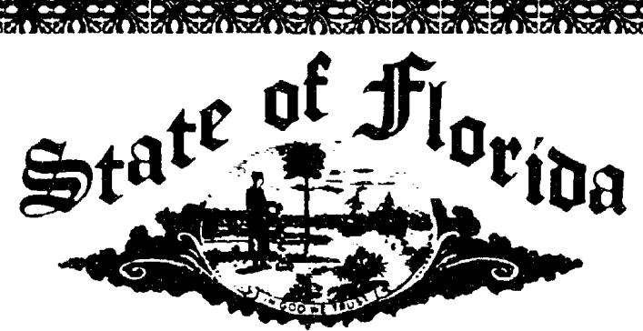
Bepartment of State

I certify the attached is a true and correct copy of the Articles of Incorporation of VILLAGE "A" HOMEOWNERS ASSOCIATION, INC., a Florida corporation, filed on September 11, 2001, as shown by the records of this office.