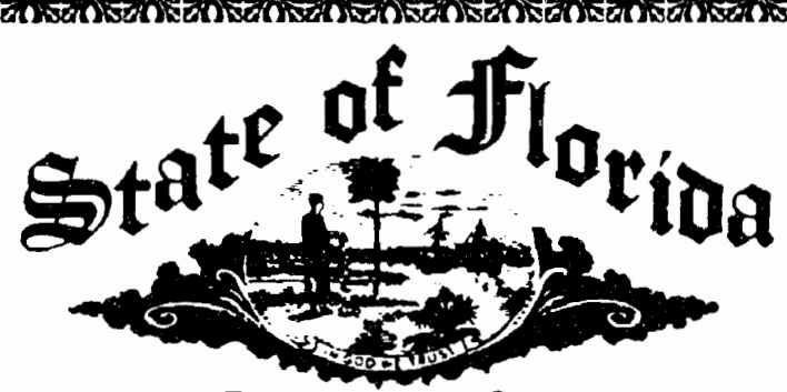
Bepartment of State

I certify from the records of this office that VILLAGE "A" HOMEOWNERS ASSOCIATION, INC. is a corporation organized under the laws of the State of Florida, filed on September 11, 2001.